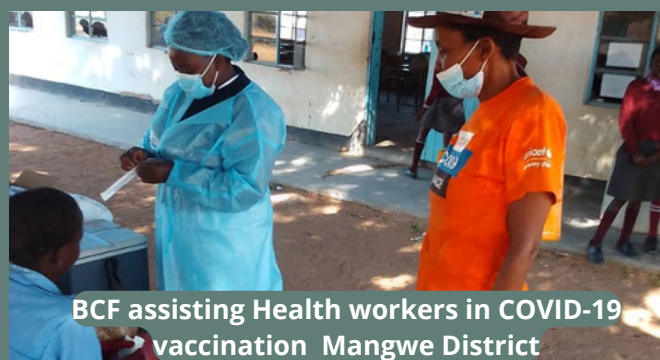
BCF assisting Health workers in COVID-19 vaccination Mangwe District

Children aged 12 and above can receive the COVID-19 vaccine. In an effort to go #ZEROCVID , more and more sites are increasing their appointment availability, and more vaccines are being sent to providers in your area every day. #DoItAll #WearaMask #WashyourHands #KeepPhysicalDistance #GetVaccinated