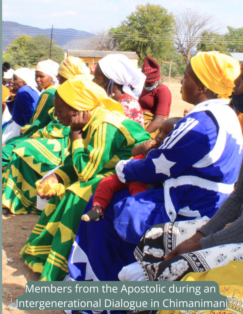
Members from the Apostolic during an Intergenerational Dialogue in Chimanimani

These conversations included the notion that religious leaders will be better able to connect with their own communities if there is more open discussion and contact between younger and older individuals. This will inspire religious leaders to approach their work with a more holistic view so that their interactions with adolescents, which are influenced by the concept of life history and experiences, more free and accepting.